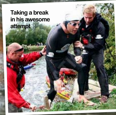
Taking a break in his awesome attempt