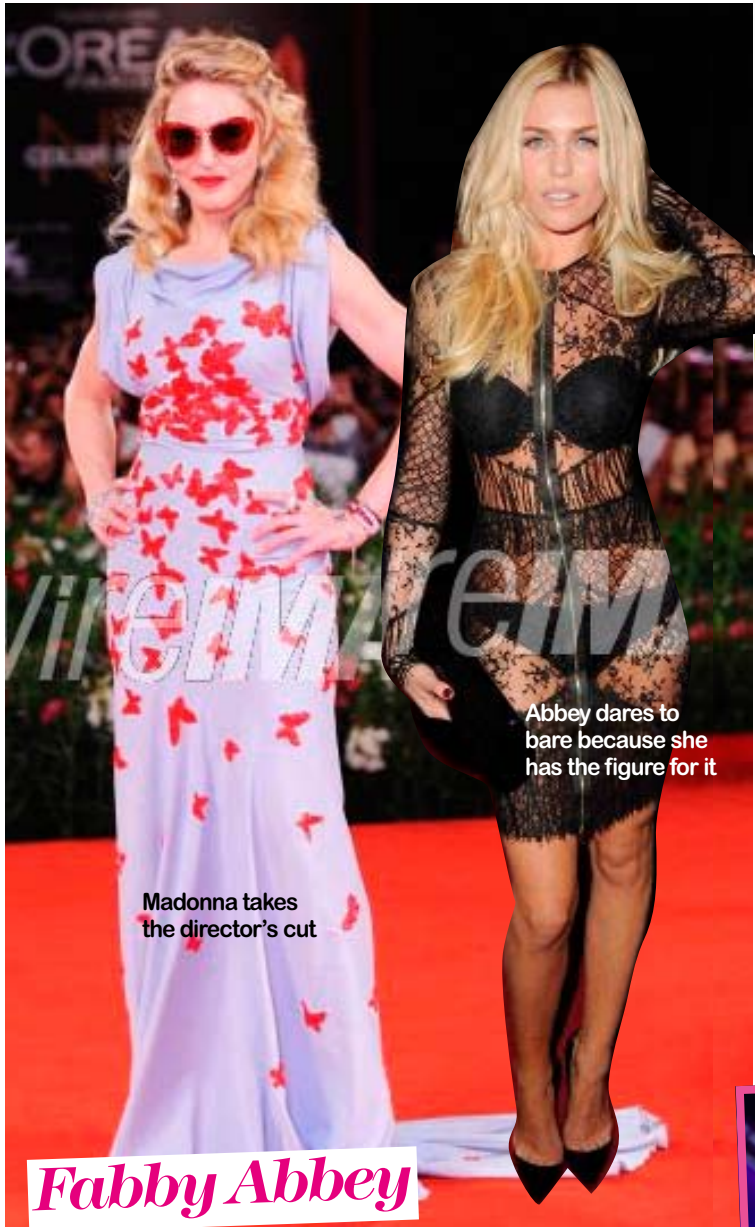
Madonna takes the director's cut

From hot headlines to juicy celebrity gossip, she's got an opinion on the lot!