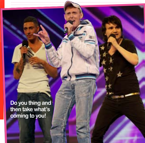
Do you thing and then take what's coming to you!

It seems to me the balance of X Factor has tilted too far towards the 'wacky' auditionees, most of whom can't sing or take criticism without a sit-down protest. They do make me giggle, but I worry that some of these people are quite vulnerable and think that finding themselves ridiculed by the nation will one day prove too much for someone. None of us will be laughing then. Bring on the talent I say and let the proper competition begin.