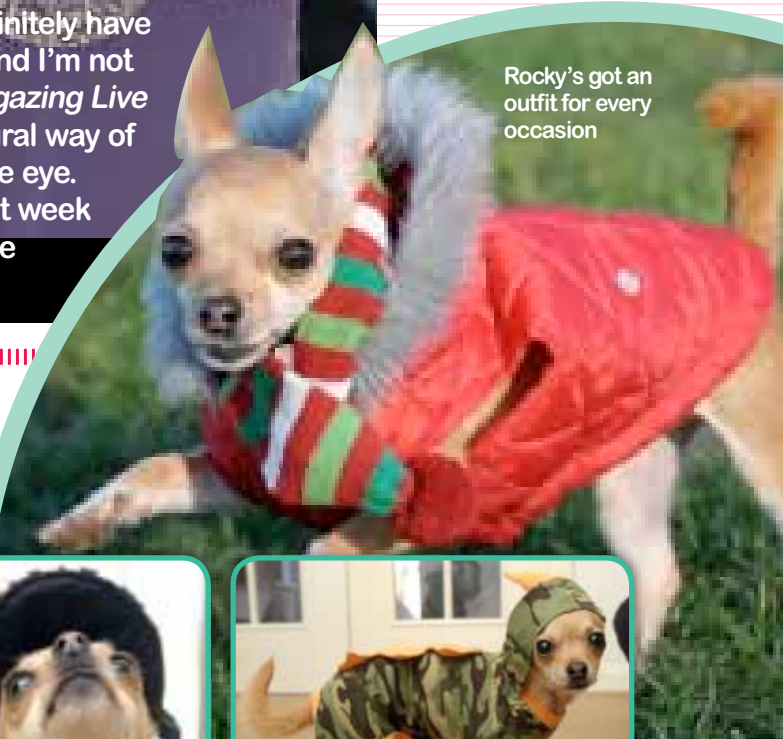
Rocky's got an outfit for every occasion