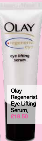
Olay Regenerist Eye Lifting Serum, £19.50