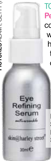
Harley Street Skin Care Eye Refining Serum, £16

Pellevé , from £300 per session (a course of three is recommended), works well on dark circles. A handpiece delivers radiofrequency to the skin's lower layers, stimulating collagen to firm, plump and thicken. It is usually painless – you'll feel a warming sensation – and results last for around six months ( www.pelleve.com ).