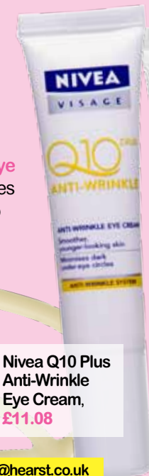
Nivea Q10 Plus Anti-Wrinkle Eye Cream, £11.08

Small amounts of Botox, from £200 , can be injected into the eyes' outer corners to smooth out wrinkles.