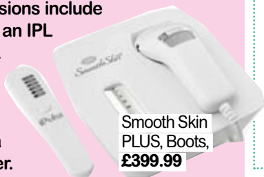
Smooth Skin PLUS, Boots, £399.99

S ick of shaving? Weary of waxing? Then try laser or IPL (intense pulsed light) hair removal. These treatments work by damaging the hair follicle to reduce or stop hair regrowth. You'll need around eight sessions, a month or so apart, with prices from £60 a session. Many types won't work on dark skin or fair hair, so check with your clinic. At-home versions include Boots Smooth Skin PLUS, £399.99, an IPL machine that you use weekly to get hair-free in 6-12 weeks – it works on fair to beige-brown skin tones. These systems are effective, but in my opinion, clinic treatments give a better result, as the laser is stronger.