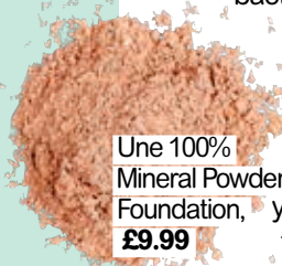
Use 100% Mineral Powder Foundation, £9.99

Liquid make-up can harbour bacteria, which can cause spots if you don't cleanse well.