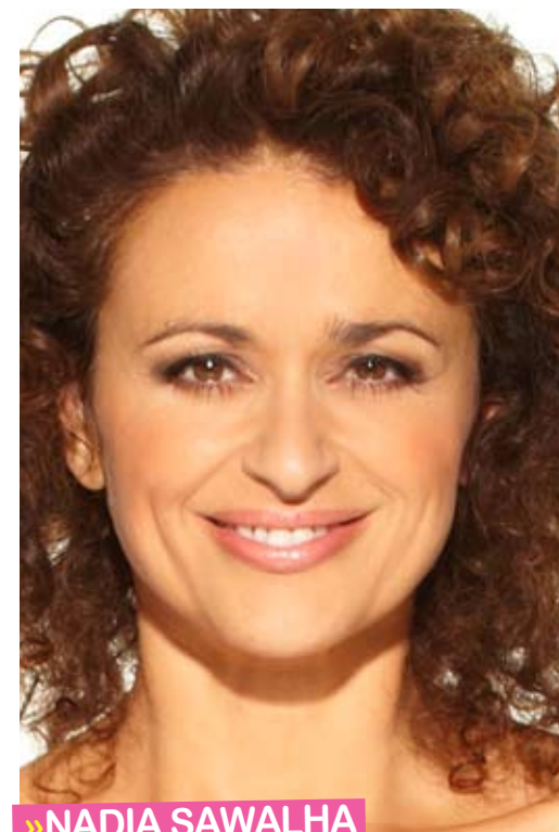
» NADIA SAWALHA