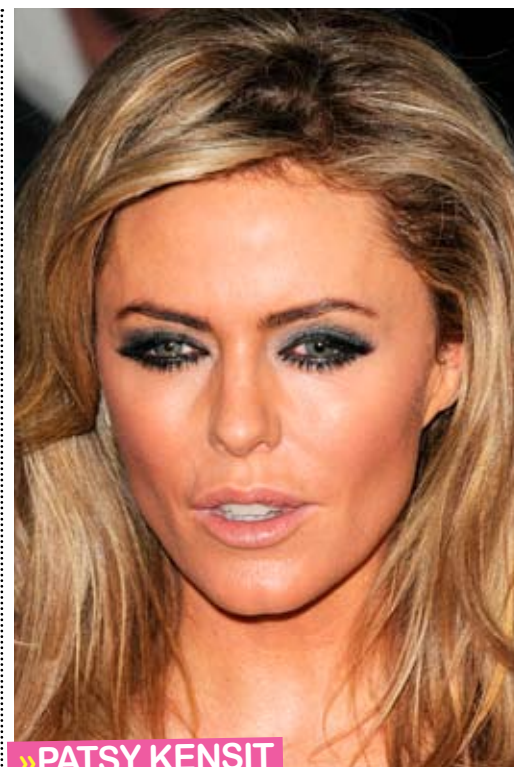
» PATSY KENSIT